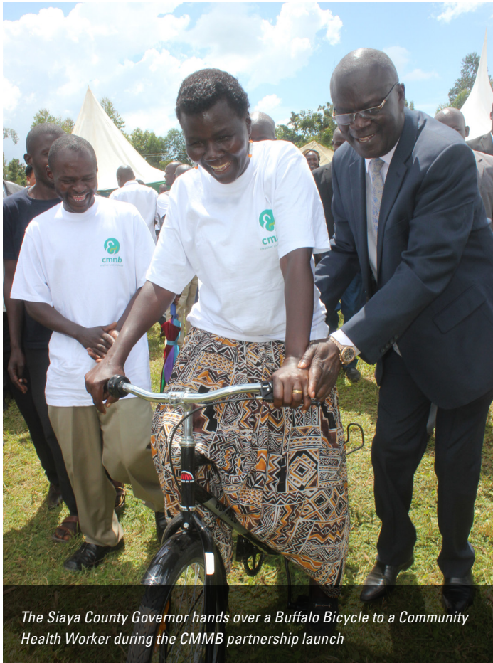
The Siaya County Governor hands over a Buffalo Bicycle to a Community Health Worker during the CMMB partnership launch

COMMUNITY HEALTH WORKERS WITH BUFFALO BICYCLES REFERRED 67% MORE PATIENTS THAN THOSE WITHOUT BICYCLES