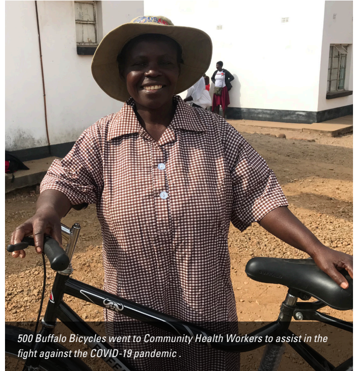
500 Buffalo Bicycles went to Community Health Workers to assist in the fight against the COVID-19 pandemic.

In all our work, the health and safety of our staff, communities that we serve, partners, and customers has been of utmost importance to us.