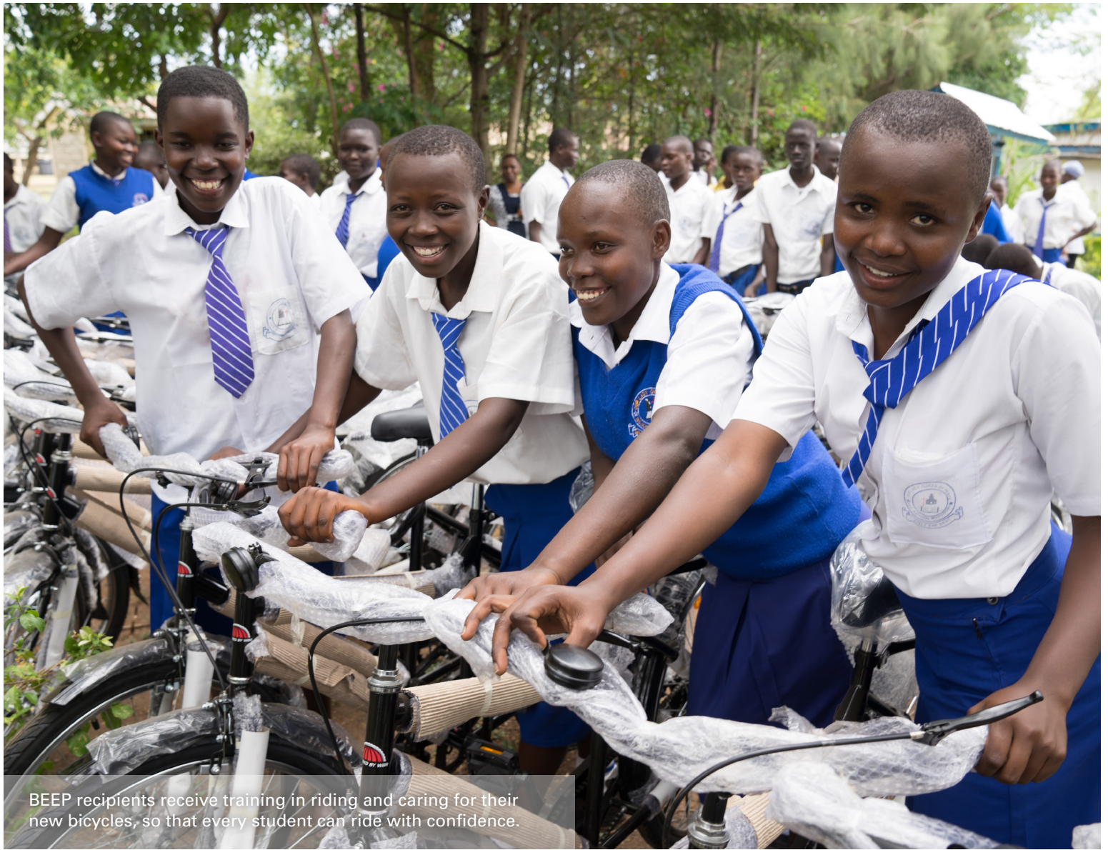
BEEP recipients receive training in riding and caring for their new bicycles, so that every student can ride with confidence.